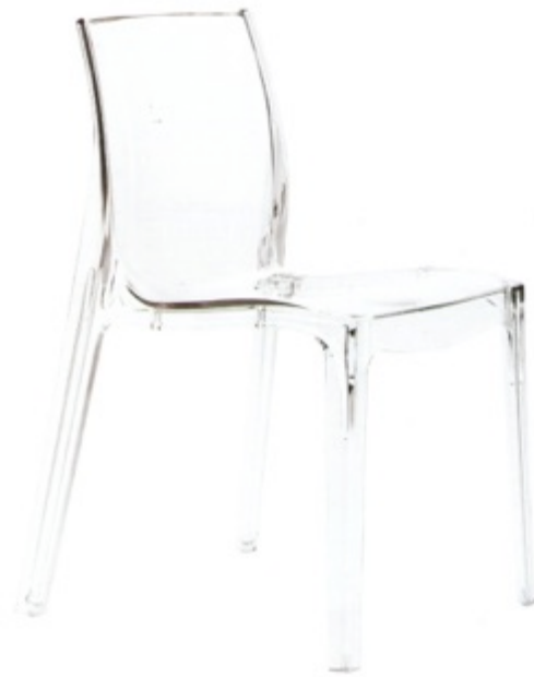
Sedia in policarbonato trasparente Transparent polycarbonate chair